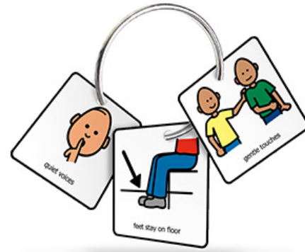
The Picture Communications Symbols ©1981–2014 by Mayer-Johnson, LLC. All Rights Reserved Worldwide. Used with permission.

Rules poster: A visual support that contains the rules and is displayed in the classroom; text is paired with a photo or an illustration that represents the rule.